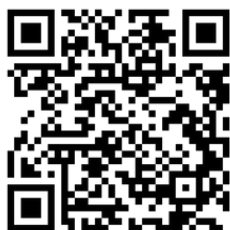
Be the Light Tap here

YOUR ONE KIND GESTURE CAN BRING HOPE TO A LIFE SUPPORT OUR CAMPAIGNS ON MILAAP